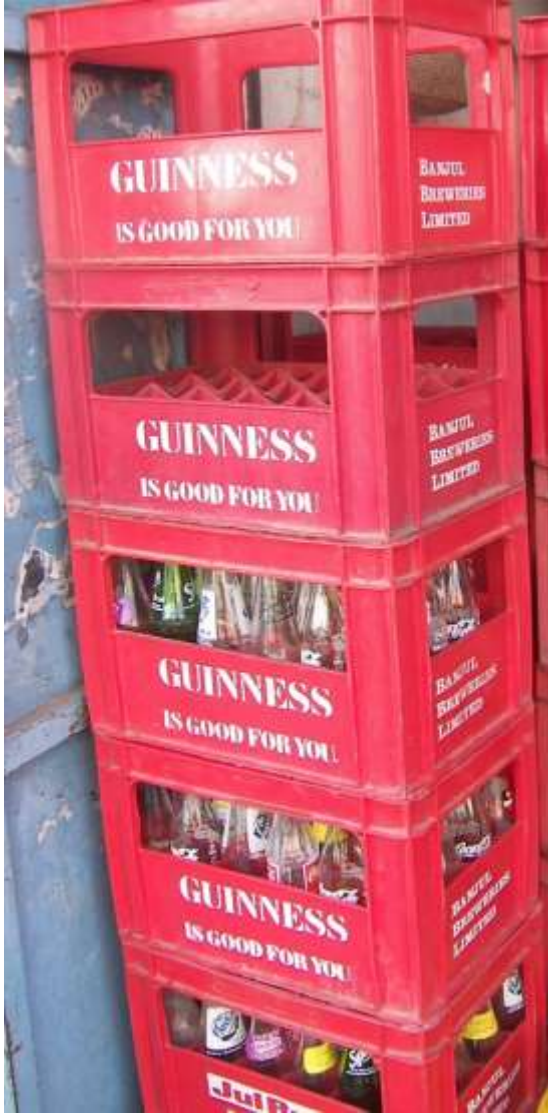
Figure 5. Example of violation of G5 (Gambia)