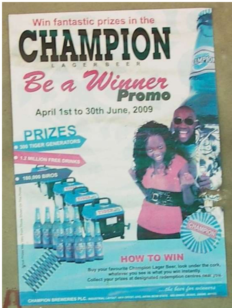
Figure 6. Example of violation of G2 (poster, Nigeria)