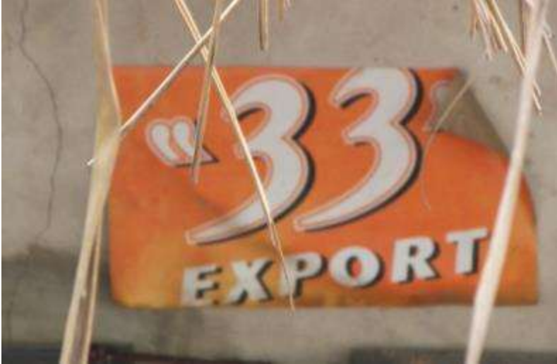
Figure 1. Example of pre-screened ad without clear violation