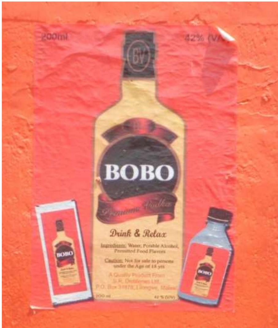
Figure 3. Example of violations G3 and G5 (poster, Malawi)