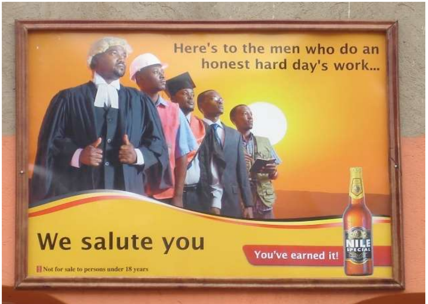
Figure 4. Examples of violation of G5 (Uganda)