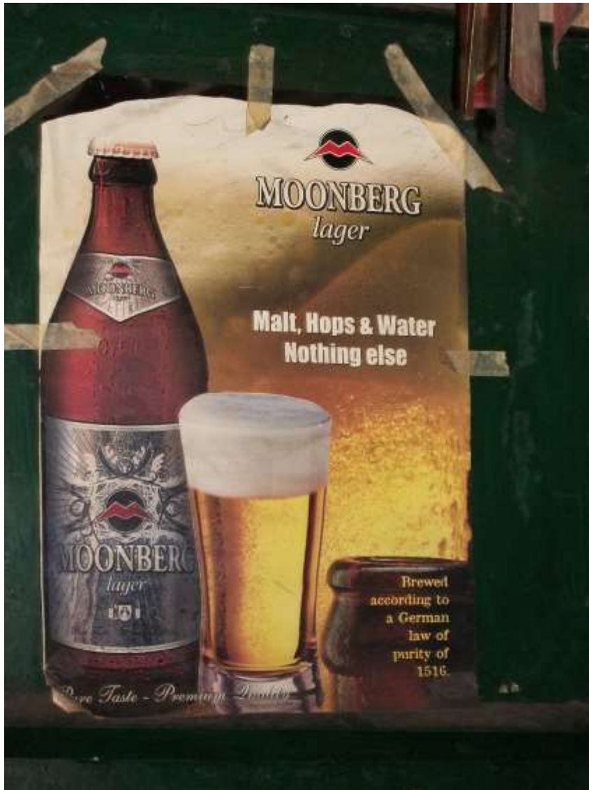
Figure 2. Example of ad with no violation (poster, Uganda)