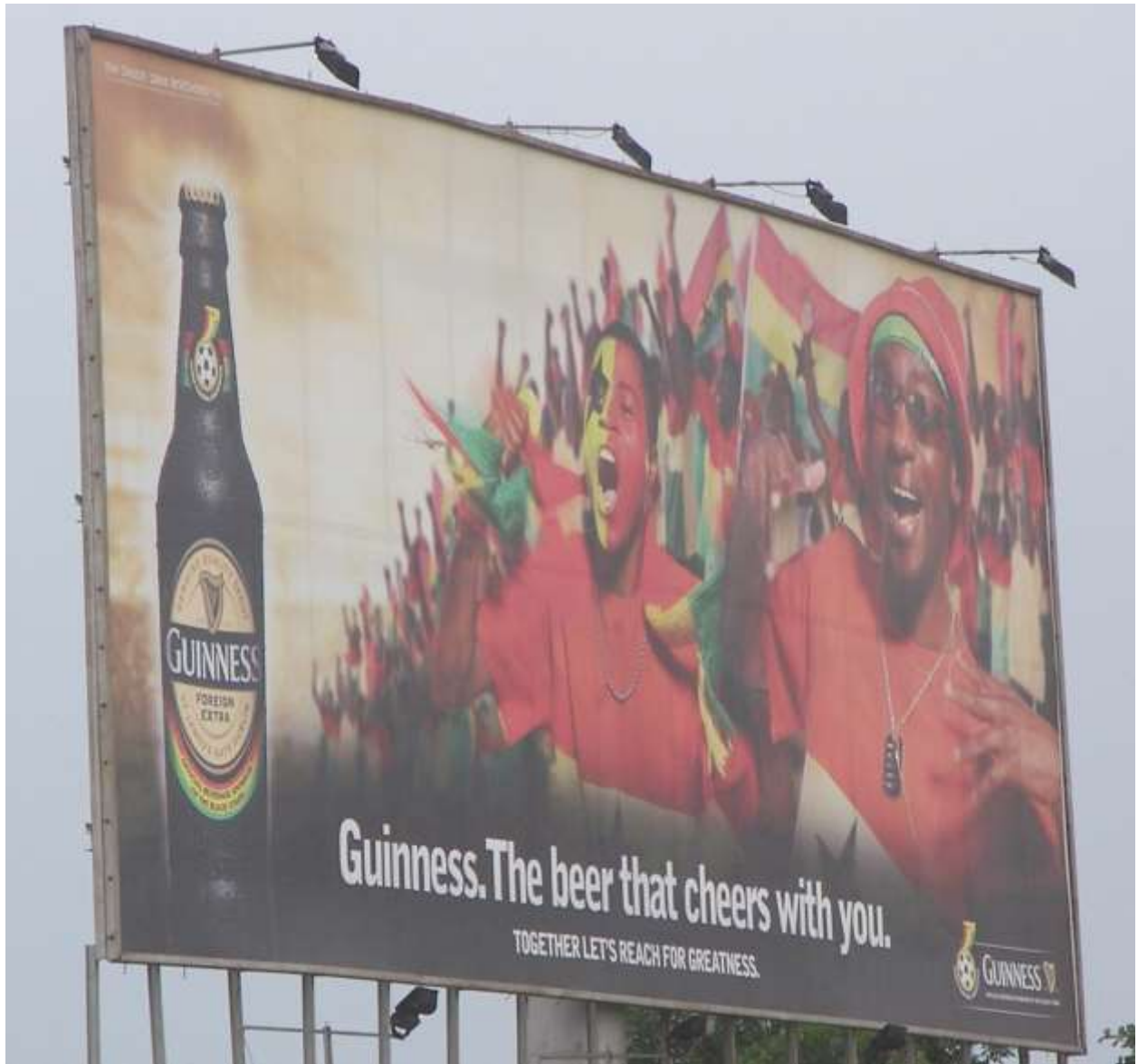
Figure 7. Example of ad rated by experts as depicting minors (billboard, Ghana)